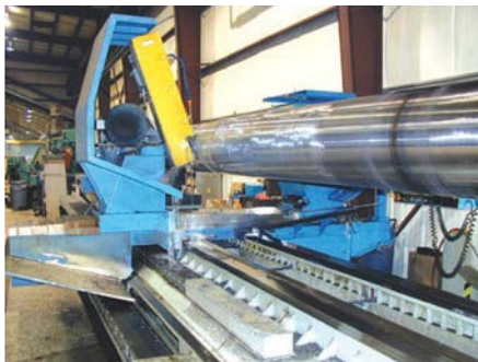
Same machine polishing helps achieve close tolerance and finishes in one step.