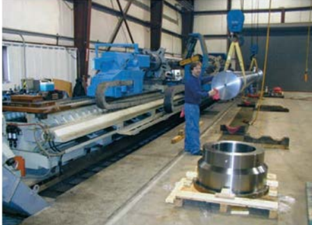
Large bar CNC threading to B/P tolerances or matched to mating nut.