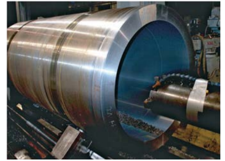
Large hydraulic cylinder machining capability.