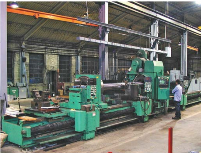
Close tolerance CNC turning measured with temperature compensating laser.

Large CNC Lathe Machining (up to 50" diameter x 42' long and 45,000 lbs.) One Piece or Production Quantities | ISO 9001 Certified