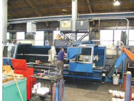
Small and mid-sized CNC turning and milling available for smaller bars.