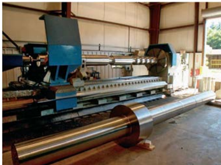
Stepped shafts or unusual shapes are easily machined with a 5-axis CNC lathe with live tooling.