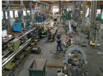
Numerous manual lathes available for quickturnaround break-down requirements.