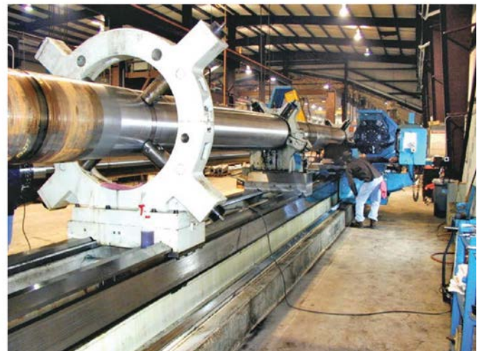
Long shaft CNC machining with live tooling for same setup secondary operations.

We offer a wide variety of machining capabilities as well as the expertise of our trained and highly experienced staff. Our 40,000 sq. ft. manufacturing building is safe, clean, and organized for efficient parts flow and throughput. We specialize in OEM & Aftermarket Machined Components and can duplicate problematic parts from samples or sketches for obsolete equipment.