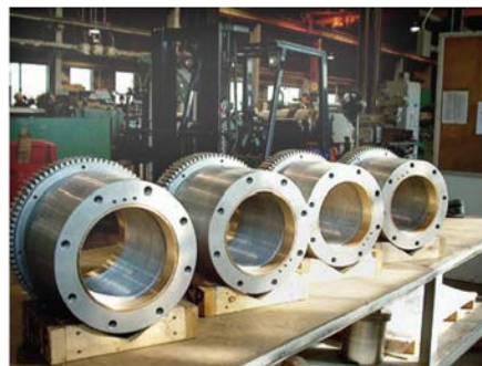
Tie bar nuts; steel, bronze, geared or sprocketed.