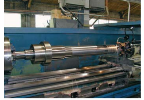
Sub-assembly with interference fit prior to or after machining is available.